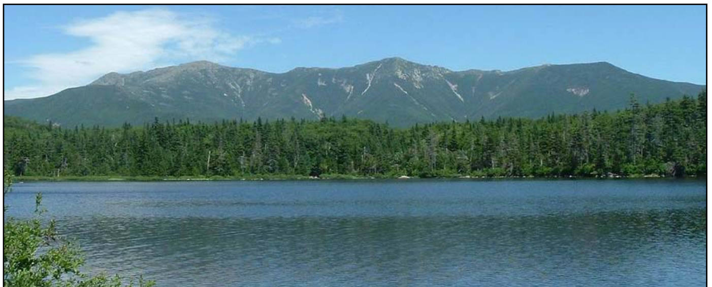
View of The Franconia Range from the West Side of Lonesome Lake

For the return route, walk the Around Lonesome-Lake Trail on the west shore. This area is mostly a BOG, and the trail is mainly on wooden logs, although it is very easy to follow. There are many openings thru the forest, which offer great views of the Franconia Range, as seen below. From left to Right are Mt. Lafayette (5260 ft), Mt. Lincoln (5089 ft), and Little Haystack (4880ft). It's hard to believe that between this lake and the mountain range is the Franconia Notch Parkway (I-93), where you started your climb. You don't hear nor see the highway. Continue around the lake to the junction with the Lonesome Lake Trail. Turning Left would bring you up to the summit of Cannon Mt, and turning right continues the around the lake route. At the Junction of Lonesome Lake trail and Cascade Brook Trail, turn left and you are on the way back down to Lafayette Campground where you started.